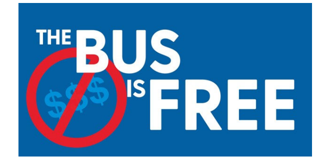
Hele-On is free until December 31, 2025! Just Hop on and Hele-On!