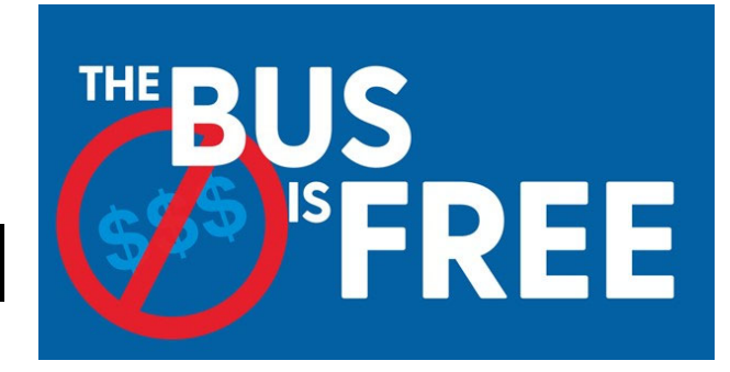
Hele-On is free until December 31, 2025! Just Hop on and Hele-On!